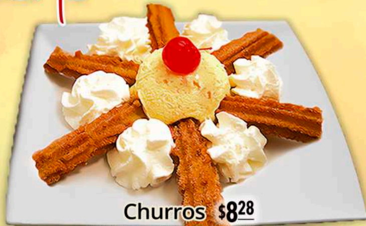
Churros $8 28

A breaded scoop of vanilla ice cream, quickly deep-fried, served with chocolate sauce, whipped cream and garnished with a mint leaf.