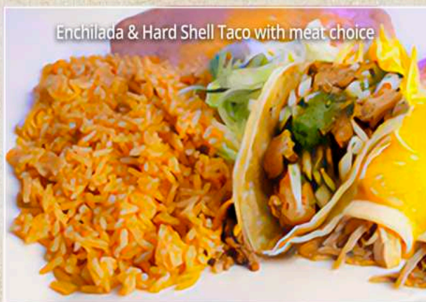
Enchilada & Hard Shell Taco with meat choice