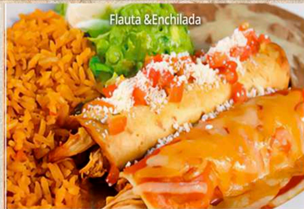
Flauta & Enchilada