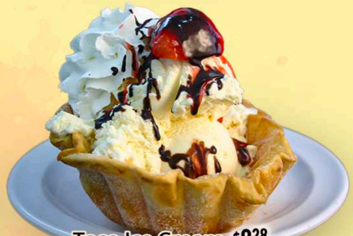
Taco Ice Cream $8 28

Creamy vanilla cheesecake wrapped in a flour tortilla, fried 'till crispy. Served with a scoop of vanilla ice cream, whipped cream and topped with a strawberry and chocolate sauce.