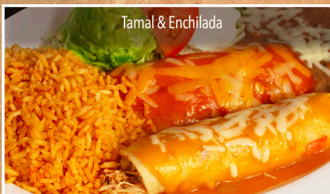
Tamal & Enchilada