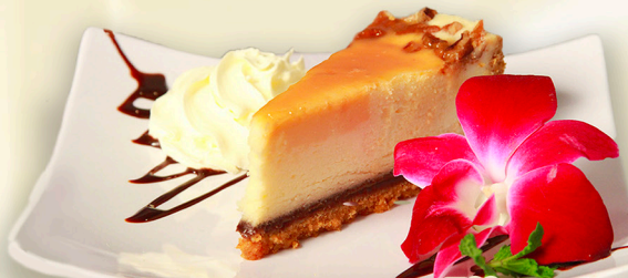
Caramel Cheesecake 789

Three scoops of vanilla ice cream served on a fried taco shell. Served with whipped cream and a cherry, and covered with chocolate sauce.