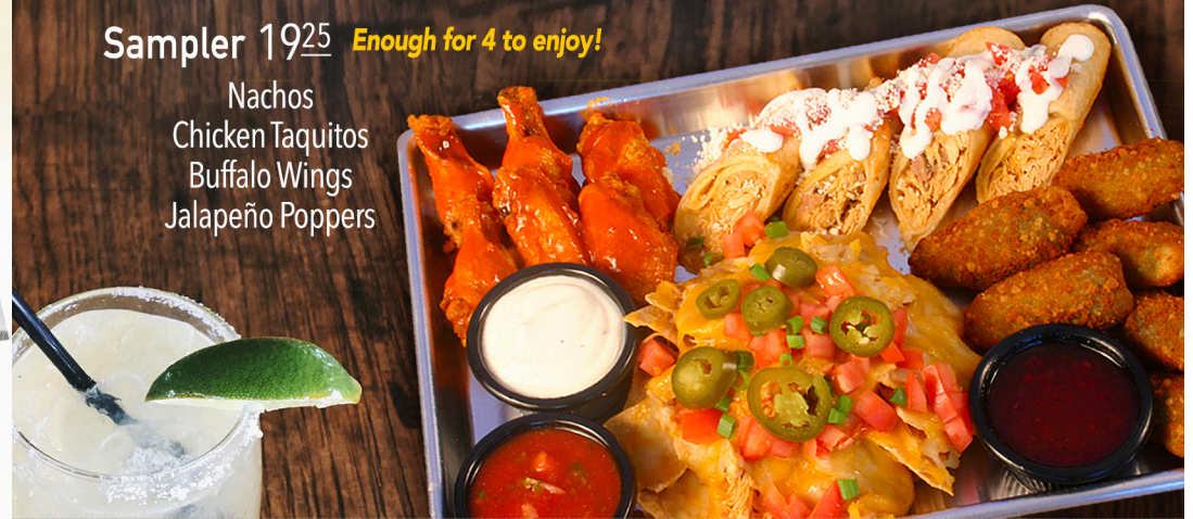
Mexican Pizza 1499

Crisp flour tortilla topped with refried beans, ground beef, melted cheese, sour cream, guacamole, tomatoes & green onion.