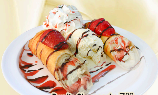
Burrito Cheesecake 789

Mildly crunchy, tender sticks of fried dough, topped with a scoop of vanilla ice cream, a cherry. Served with whipped cream.