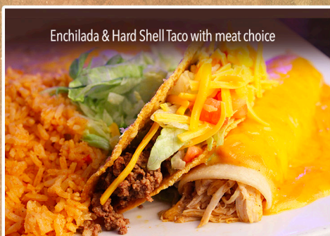
Enchilada & Hard Shell Taco with meat choice