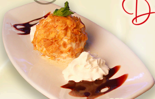
Fried Ice Cream 850

A breaded scoop of vanilla ice cream, quickly deep-fried, Served with chocolate sauce, whipped cream and garnished with a mint leaf.