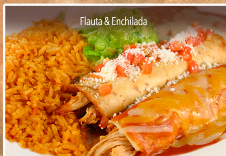
Flauta & Enchilada