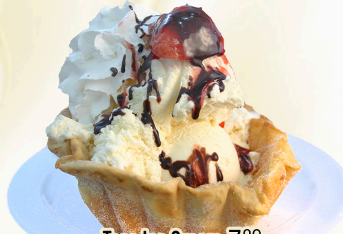
Taco Ice Cream 789

Creamy vanilla cheesecake wrapped in a flour tortilla, fried 'till crispy. Served with a scoop of vanilla ice cream, whipped cream and topped with a strawberry and chocolate sauce.