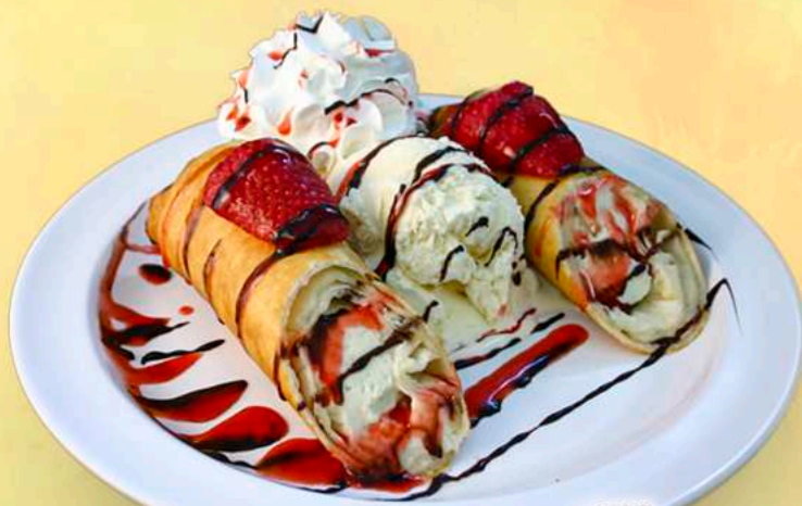
Burrito Cheesecake $8 28

Mildly crunchy, tender sticks of fried dough, topped with a scoop of vanilla ice cream, a cherry. Served with whipped cream.