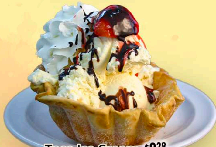
Taco Ice Cream $8 28

Creamy vanilla cheesecake wrapped in a flour tortilla, fried 'till crispy. Served with a scoop of vanilla ice cream, whipped cream and topped with a strawberry and chocolate sauce.