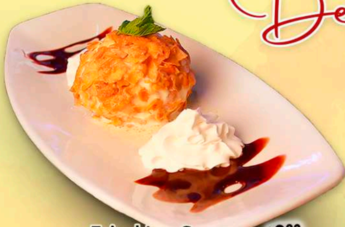
Fried Ice Cream $8 93

A breaded scoop of vanilla ice cream, quickly deep-fried, served with chocolate sauce, whipped cream and garnished with a mint leaf.