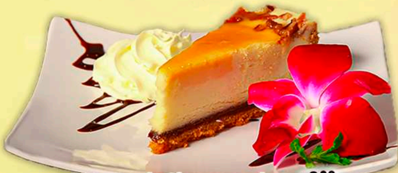
Caramel Cheesecake $8 28

Three scoops of vanilla ice cream served on a fried taco shell. Served with whipped cream and a cherry, and covered with chocolate sauce.