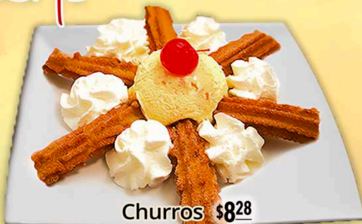
Churros $8 28

A breaded scoop of vanilla ice cream, quickly deep-fried, served with chocolate sauce, whipped cream and garnished with a mint leaf.