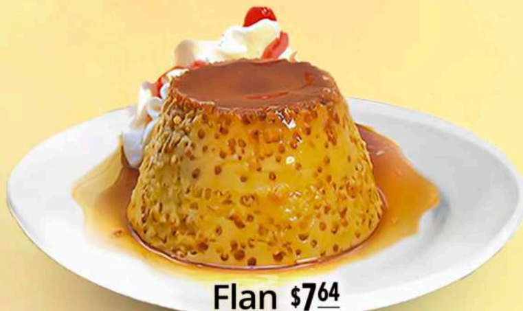
Flan $7 64

Served with whipped cream on a chocolate sauce. Garnished with a mint leaf.